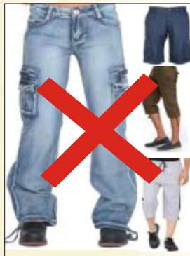
Jeans/ cargos pants/ short pants