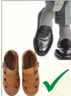
Formal shoes with socks/ closed sandals