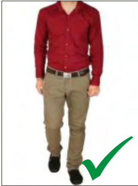
Tucked in full length formal shirt and pant